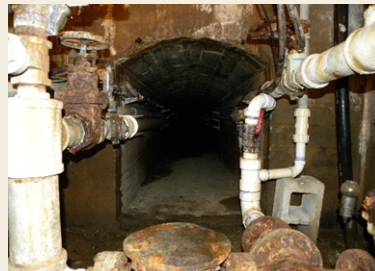
ORIGINAL FOUNTAIN PUMPS

Since 2014, there have been renovations and routine maintenance projects completed totaling 2.5 million dollars. Much of the original infrastructure from 1932 remains. Some recent renovations include: